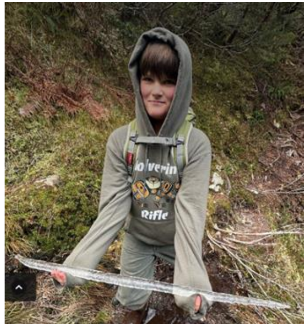
The unassuming hero displays his secret weapon.

Her miserable life of unending toil came to an abrupt and happy ending last week when she was rescued by a hooded figure clad all in green, rumored to occasionally go by the name “Sky Guy”, although he prefers to remain anonymous.