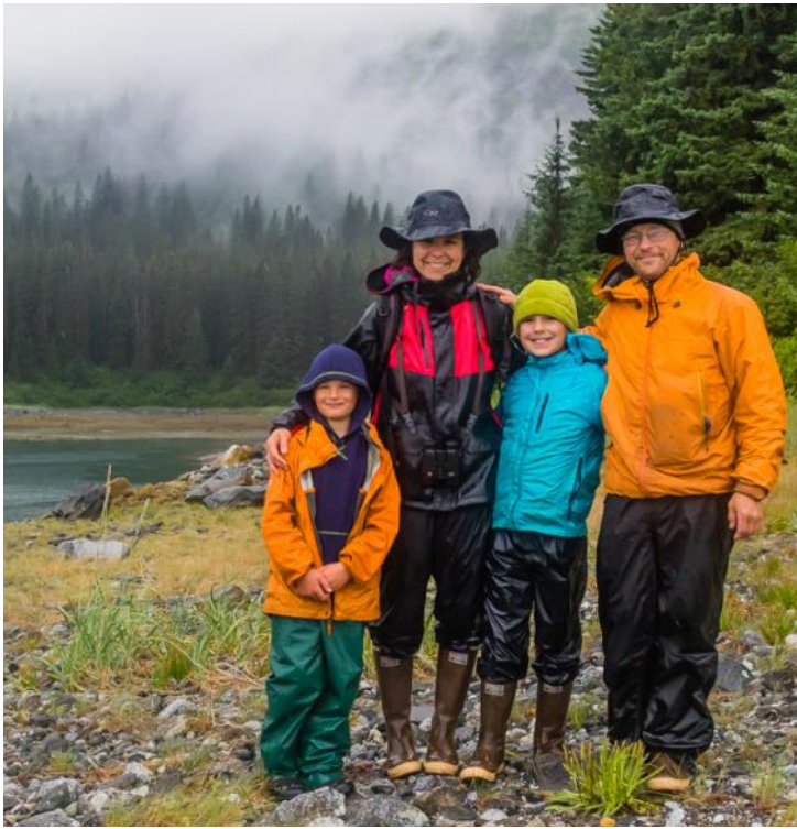
Example photo “Before”