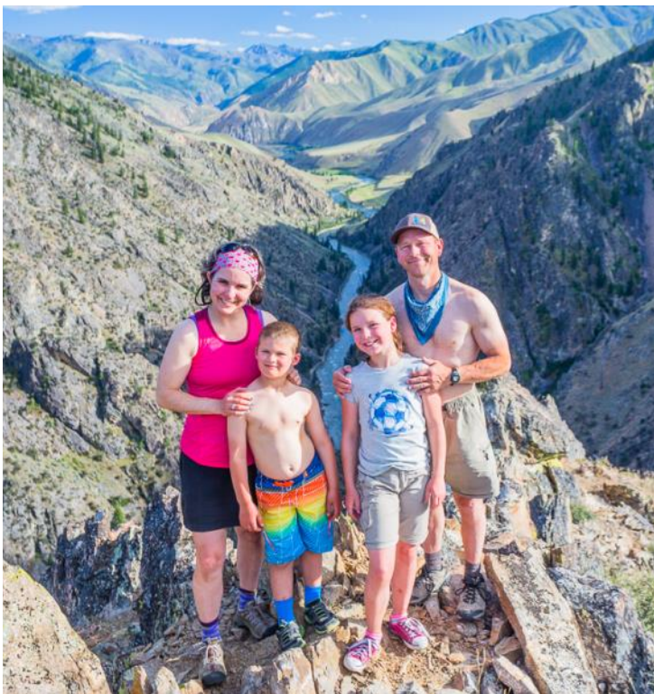
Example photo “After”

(Note – for an extra fee, Alaskan customers can also have their images retouched so that any visible unnaturally pale skin appears tan.)