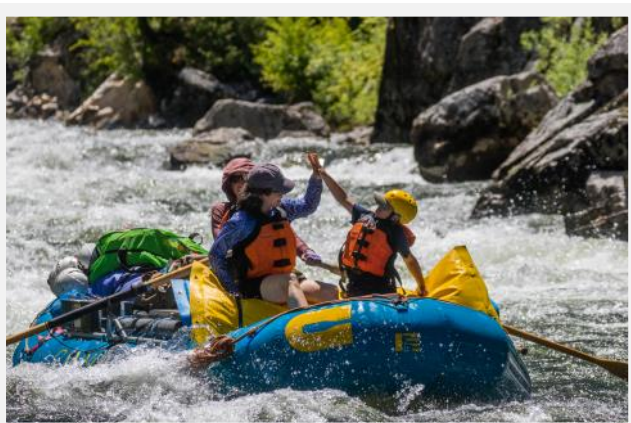
Salmon River, Idaho - Jun 2018