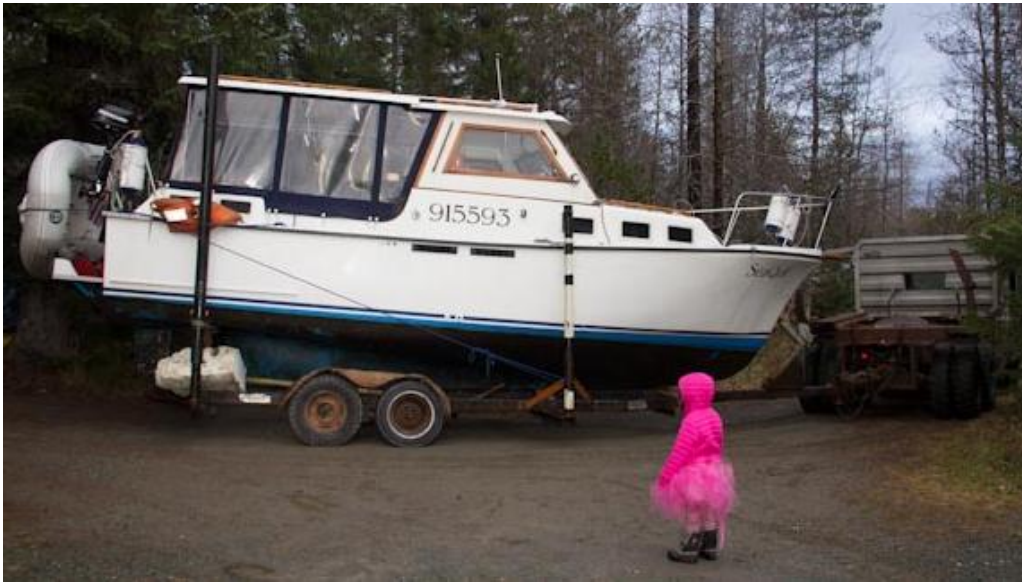
Our new boat! Captain in training in foreground (note official maritime uniform.)